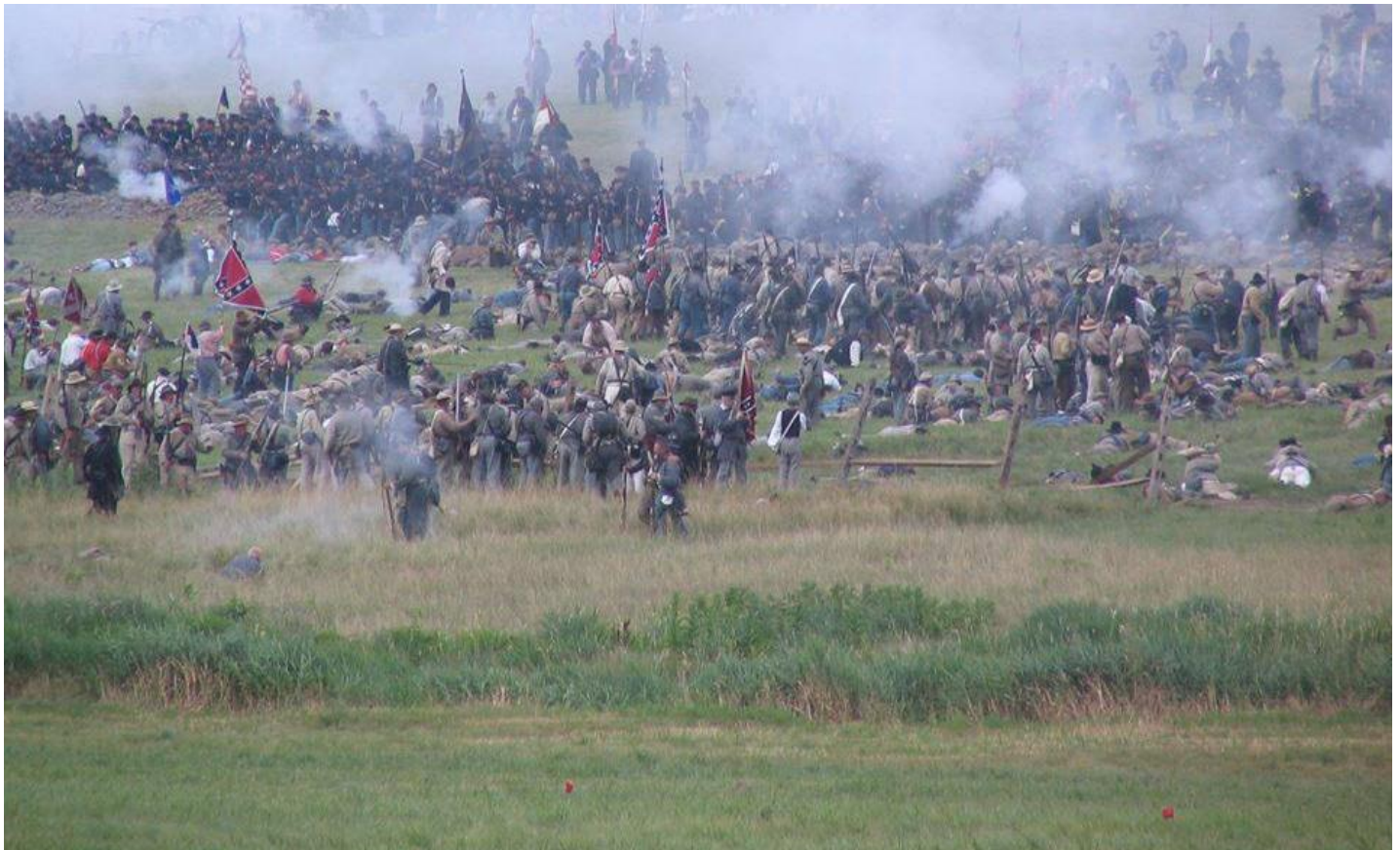
The Pickett-Pettigrew-Trimble Charge, July 7 th , 2013

The weather for the first event, the Blue Gray Alliance event, was more comfortable with highs in the mid-80s and a brief rain storm each afternoon/evening. By the second event, the Gettysburg Anniversary Committee event, the temperatures had climbed into the low 90s, but the afternoon rain storms were absent until the final battle on Sunday, July 7 th . The increase in temperatures, combined with long marches from camp to the battlefield, took its toll on the troops. For some reason, the infantry camps were placed the furthest away, and up a hill, at both events! There must be some sound military logic for this strategic placement of infantry camps; however the reasoning is not apparent to the lowly sergeant.