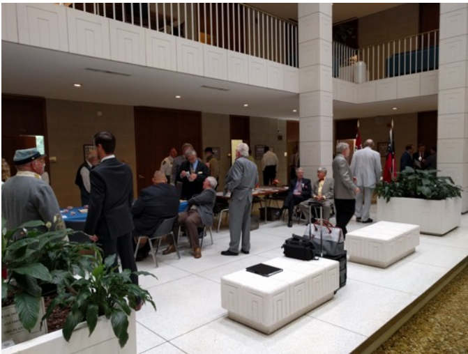
Tables setup in the court for the various organizations.

The 2 nd Annual Heritage Day at the NC Legislature was held on Wednesday, May 10 th . SCV members from across the state visited their state senators and representatives discussing our organization and concerns. Tables were setup for the various organizations in the 1100 court (NE court) of the main legislative building. The organizations were recognized when the House convened for its session; including; Sons of Confederate Veterans, United Daughters of the Confederacy, Military Order of the Stars and Bars, Order of Confederate Rose and others.