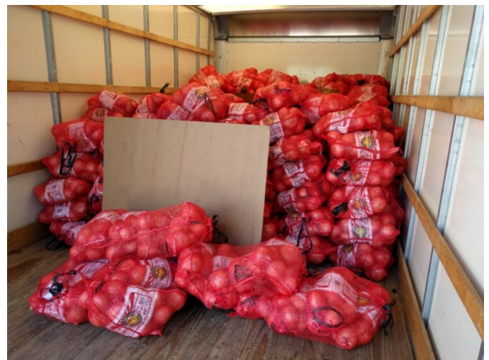
This is what 650 10 lb. bags of onions (3 1/4 tons) looks like!