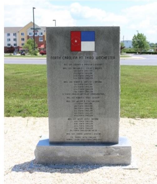
NORTH CAROLINA AT THIRD WINCHESTER

ERECTED BY THE SOCIETY OF THE ORDER OF THE SOUTHERN CROSS THE STONEWALL JACKSON CHAPTER #220 UNITED DAUGHTERS OF THE CONFEDERACY THE ROBERT E LEE CONFEDERATE HERITAGE ASSOCIATION THE 13 TH NC TROOPS (REACTIVATED) THE 30 TH NC TROOPS (REACTIVATED) THE 43 RD NC TROOPS (REACTIVATED) LATHAMS NC BATTERY (REACTIVATED) THE EGBERT A ROSS CAMP SONS OF CONFEDERATE VETERANS JAMES MILLER CAMP 2116 SONS OF CONFEDERATE VETERANS MAY 2017