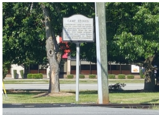
The repaired historical marker for Camp Stokes on Battleground Avenue.