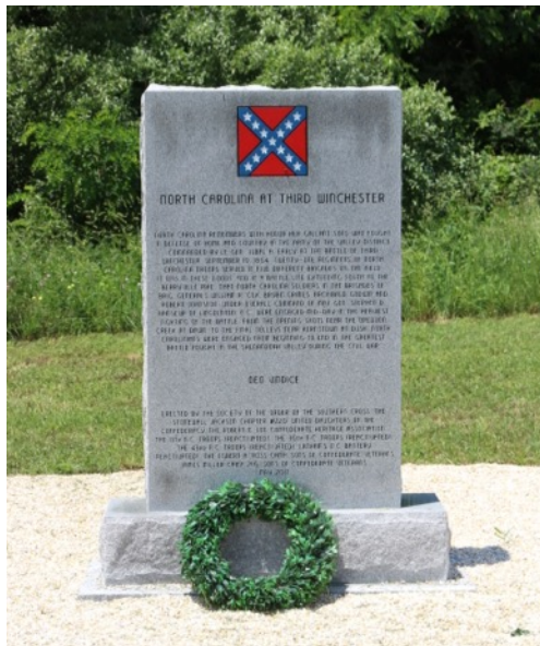
NORTH CAROLINA AT THIRD WINCHESTER

As reported in the April 2018 edition of our newsletter, a new memorial honoring North Carolina Troops was dedicated on April 14 th in Winchester, Va. The memorial is located at 170 Getty Lane, Winchester, VA 22602.